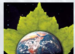
Kendrion Power Transmission protects people and the environment